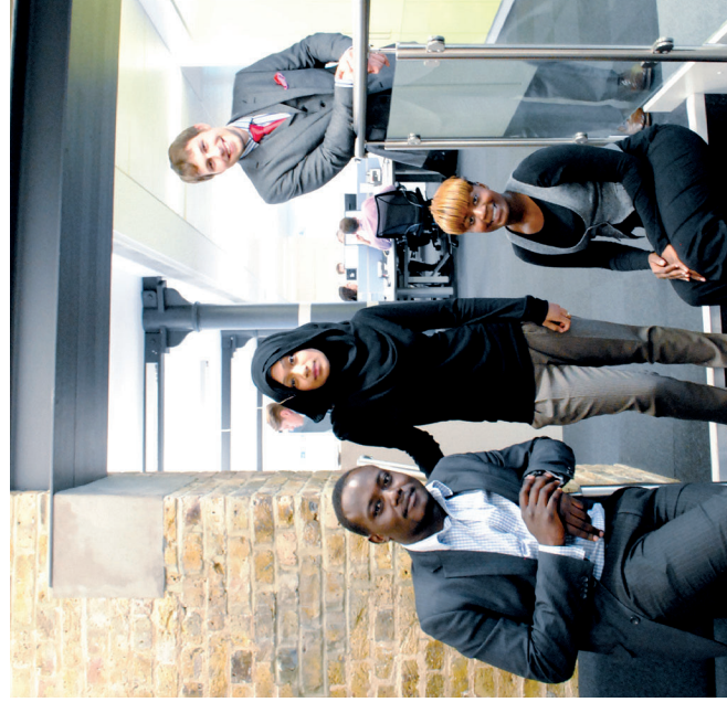
Staff in our Tooley Street offices

In February 2012, the council agreed a balanced budget of £308.2m for 2012/13 and agreed to freeze council tax. This is the fourth consecutive year that it has been frozen. The budget included £10.8m of financial commitments and growth in additional or new services. Over the year, budget reductions, savings and efficiencies of some £28.3m were achieved. Through all this, the council has continued to promote a Fairer Future for All in Southwark by targeting support for the low paid, children and the more vulnerable in the community: