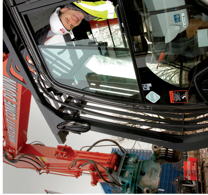
Work begins at the new Elephant and Castle leisure centre