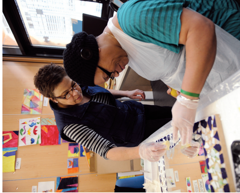
Crafting at the Southwark Resource Centre

Support vulnerable people to live independent, safe and healthy lives by giving them more choice and control over their care.