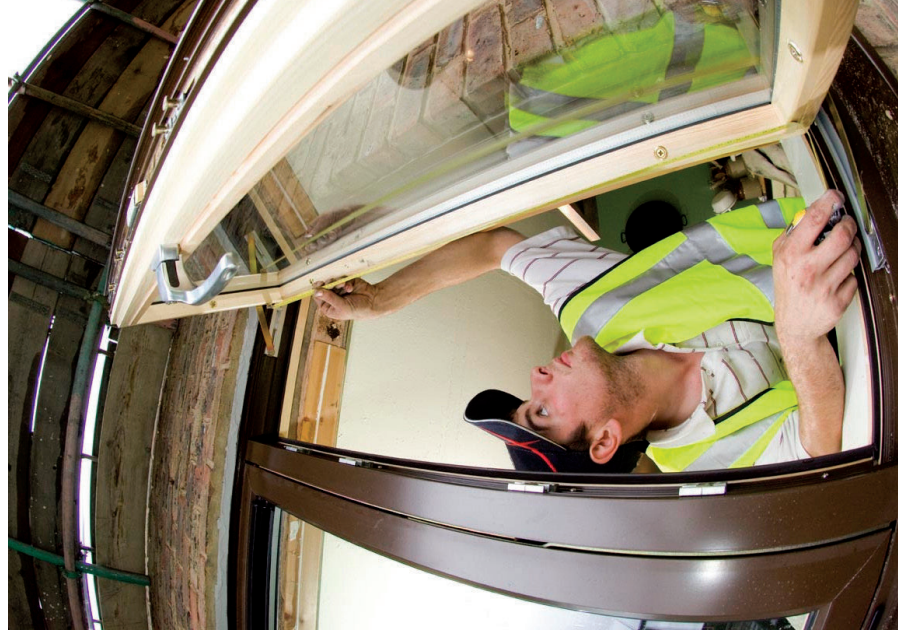
Repairs getting underway

Deliver the first three years of our five year plan to make every council home warm, dry and safe.