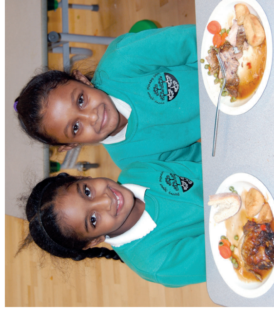
Two Southwark school children enjoying their free, healthy school meals

More children are receiving a free healthy school meal. This year has seen our programme successfully rolled out to years two and four with around 10,000 or 91 per cent of primary school pupils from reception up to year four now eating a school lunch. Having a free healthy school meal is of particular benefit to low-income families who currently fall just outside the national criteria and low-to-medium income families with more than one child. In addition, eating a healthy school meal as part of a whole-school approach to healthy eating and healthy weight contributes to reducing levels of obesity.