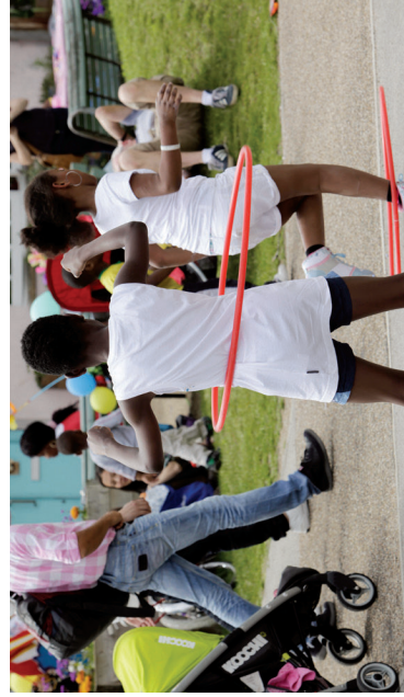
Hulahooping at Burgess Park

Encourage healthy lifestyles by transforming Burgess Park, opening a new swimming pool at Elephant and Castle and awarding £2m to local sports projects to leave a lasting Olympic legacy.