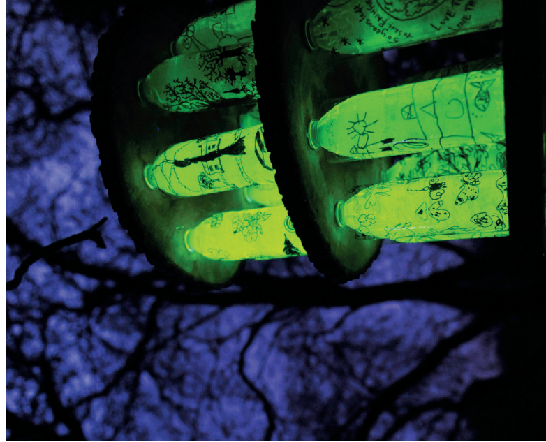
Recycled art at our Tree Tales event

Double recycling rates from 20% to 40% by 2014 and keep our streets clean.