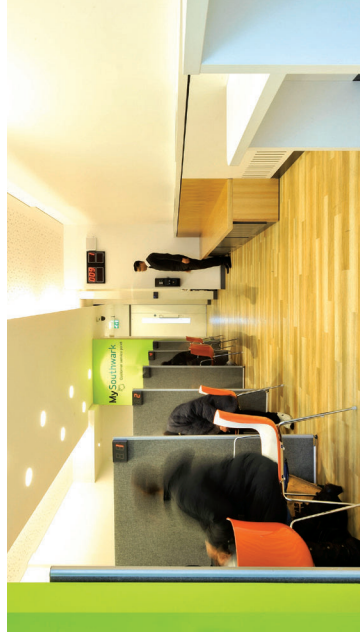
Our new customer service point in Bermondsey

Improve our customer service with improved online services, including delivery of a better housing repairs service, independently verified by tenants.