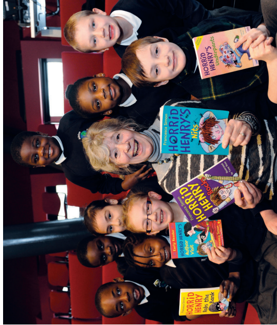
Sharing some favourite reads on World Book Day