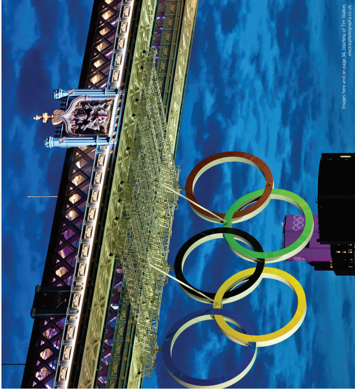
Images here and on page 34, courtesy of Tim Walker, electrphotography.co.uk .